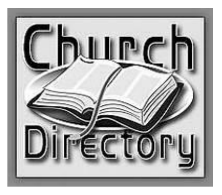
2 More Days To Sign-Up For Directory Pictures

Please Use The QR Code (in the church bulletin) Or Check With The Church Office